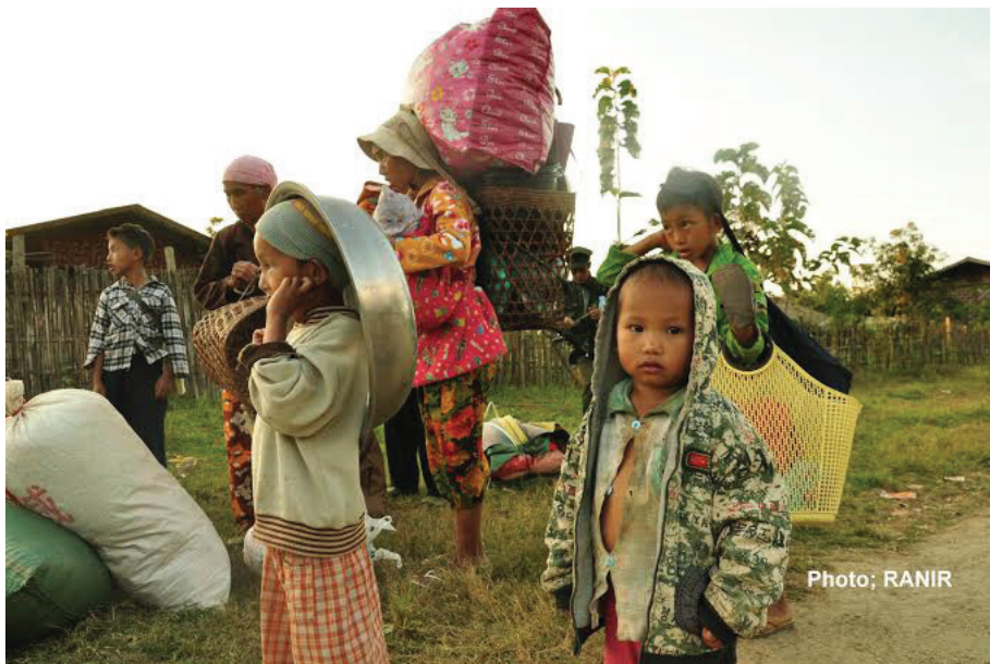
“Families fleeing ongoing fighting in Kachin State, 2013

For these reasons, most of the rapes documented by WLB member organizations over the past three years may be qualified as war crimes.